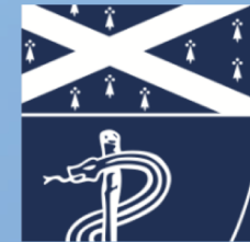
Yale University School of Medicine