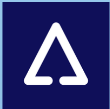
McKesson Health IT